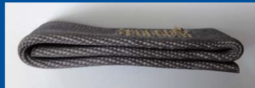
six-ply sewing for seatbelt

The use of the advanced controlled, heavy duty feed mechanism provides excellent, superb stitch quality and tight stitching even for extra-heavy sewing applications. Also, the upper thread feeding device which supplies the necessary length of upper thread at the start of sewing, preventing the thread from pulling-out regardless of the material feeding amount.